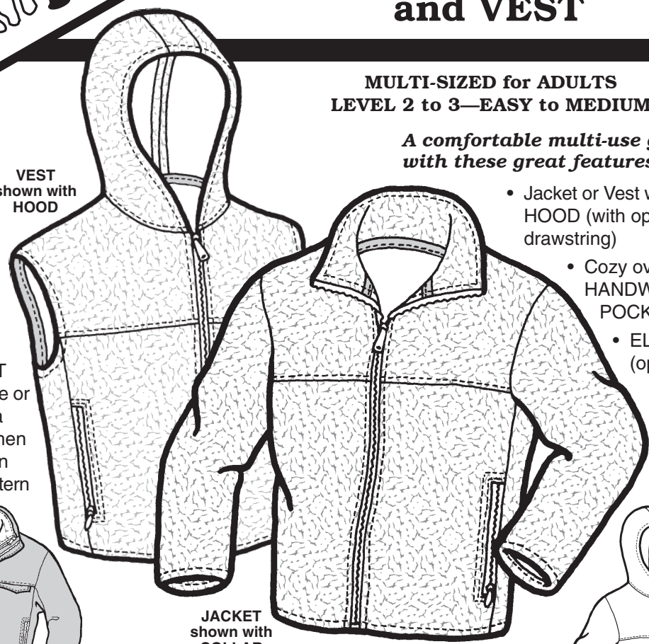
JACKET shown with COLLAR